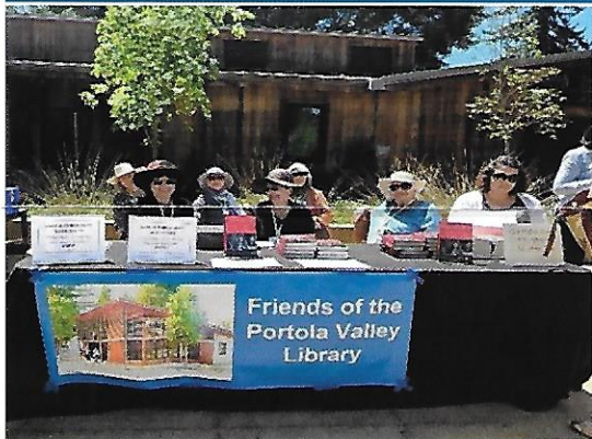
Some of our FOPVL Board members at the Jackie Speier event